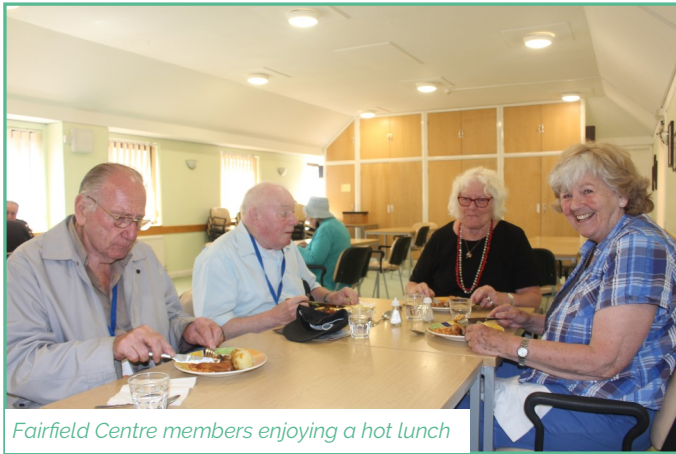
Fairfield Centre members enjoying a hot lunch

As restrictions have eased we have been delighted to gradually reopen our Fairfield Centre and start to re-establish the lovely community we had before the world changed. From the small beginnings of the outdoor "Terrace Café" in April, through to indoor pre-booked lunches in August and now to the return of activities, it really has been a joy to welcome so many of you through our doors once more.